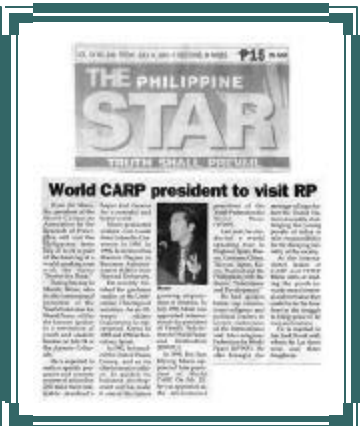
The Manila Press gave full coverage in the days leading up to the event