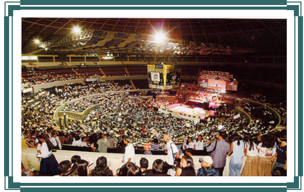
A full house of 15,000 young Filipinos in attendance at the Araneta Coliseum, the nation's premier indoor arena