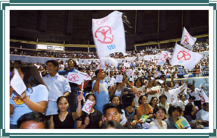
60,000 youth hear the Service for Peace message in July

This is the time of a new counter-counter cultural revolution, to set things straight. This is the task of the youth of this age. Who will lead Service for Peace ? You will! I want you to be a peacemaker who has committed his or her whole life to building God's kingdom on earth. Those of you who believe it to the fundamental core of their bone marrow, and are willing to carry this message forward, rise up with me and say, Amen!