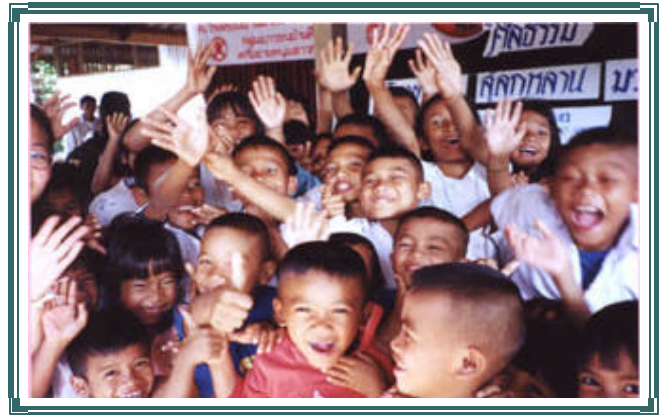
Bright Steps for Young People Project in Bangkok

Service for Peace projects in Bangkok have just started. We are planning to visit many high schools in order to hold abstinence education seminars for the students. Basically, local CARP centers hold educational projects for university students and high school students. The directors and teachers of schools warmly welcome to us. CARP leaders also gave presentations on the Pure Love Project to the vice governor in general education secretary of Pitsanuloke province.