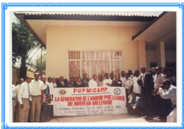
Government officials, students and CARP members in the Congo