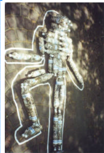
Delicate North Korean Embroidery