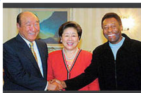
True Parents with Pele