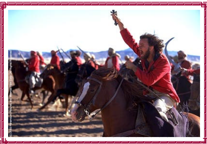
Heath Ledger as Harry warns his colleagues of impending doom