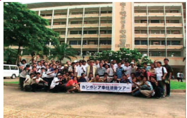
The Exchange Volunteers in Phnom Penh

The symposium dealt with two themes of great concern to young people in Cambodia: the problem of AIDS and the challenge of community development in a nation still recovering from decades of horror. In particular, there is a need for a safe