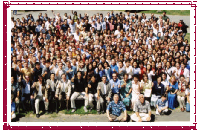
The STF Annual Workshop with Hyun Jin Nim at UTS

Well, there is new hope on the horizon, as the song goes. In the past two years, the STF (Special Task Force) program in the US has grown by leaps and bounds and is multiplying overseas. here have been some very difficult moments, especially last month with the sud-