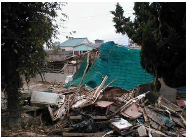
Cleaning Up After Typhoon Devastation

Due to the typhoon, public roads were disrupted and volunteers had a hard time getting there and their tasks were much more difficult than they thought. At the disaster-stricken area there were 5-ton trucks and carts waiting for the volunteers. After lunch they hastily continued their work after a short meal of kimbap for fear of rain. The factory owner and drivers voiced their concern and told volunteers to take it easy but they were