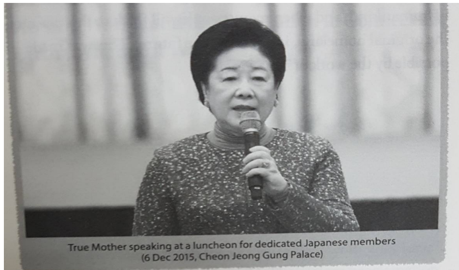
True Mother speaking at a luncheon for dedicated Japanese members (6 Dec 2015, Cheon Jeong Gung Palace)

move forward with True Mother by achieving oneness in heart, oneness in body, oneness in harmony and oneness in thought with True Parents, then you can surely bring victory. You are blessed. Even though there are 7 billion people in the world, you and your family are especially blessed thanks to True Parents. You need to live your life every day with a heart of gratitude for the future.”