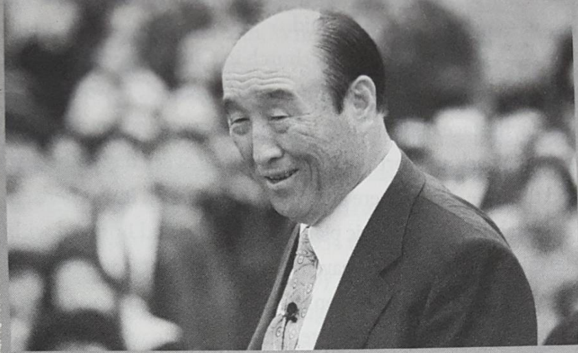
True Father speaking to members at the groundbreaking for the Cheongpyeong Heaven and Earth Training Center (10 Mar 1997)

providence, leadership training within the church, and Principle training and education of heart for the entire church membership, and the training center supported True Parents' work in this way for 24 years, from July 12, 1971 to January 19, 1995.