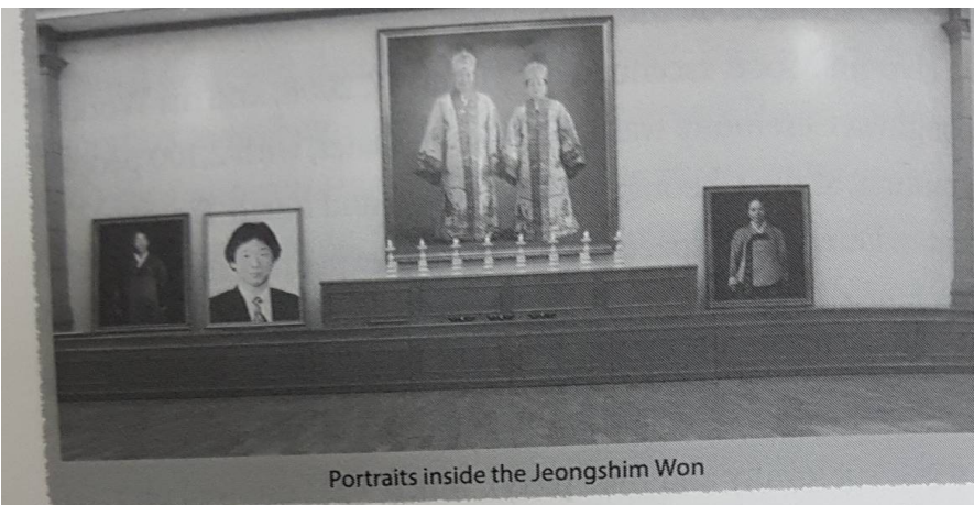
Portraits inside the Jeongshim Won

Now the system for ancestor liberation is well organized, bringing more absolute good spirits. The time has come for our members to come to Cheongpyeong to experience the Cheongpyeong works. Coming to the Cheongpyeong Heaven and Earth Training Center and joining the Chanyang Yeoksa