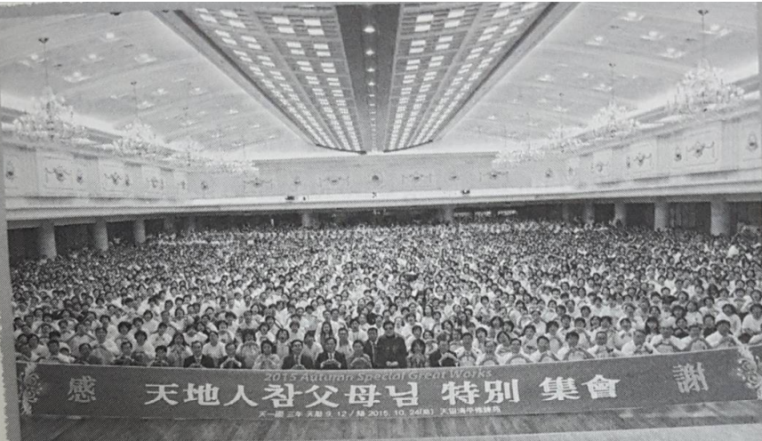
Special Gathering with the True Parents of Heaven, Earth and Humankind (24 Oct 2015, Cheongpyeong Heaven and Earth Training Center)

kind of place where the entire world wants to come visit, and where they will want to live. Within 10 years, we will make Cheongpyeong an amazing place. Cheongpyeong will be the most beautiful place in the world. When you come here, you will find happiness, as well as emotional support to nourish your mind and body.” (23 Nov 2015)