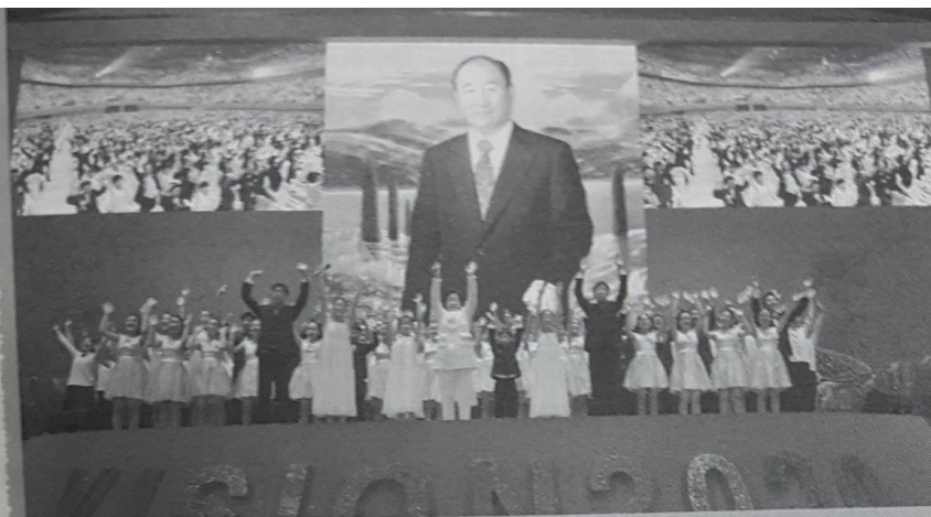
Memorial Service marking the 1st Anniversary of the Universal Seonghwa of Sun Myung Moon, True Parent of Heaven, Earth and Humankind (23 Aug 2013, Cheongshim Peace World Center)

Cheongpyeong Holy Ground while 35,000 worldwide representative members attended under a solemn atmosphere. After his Universal Seonghwa, True Father not only reformed the spirit world but rearranged the order of spirit world, and granted greater grace and forgiveness. True Mother also said "Spirit world has been changed after True Father's Universal Seonghwa."